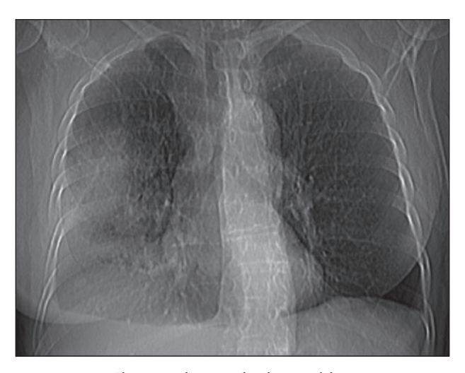
FIGURE 1. Chest radiograph showed homogeneous opacities as well as a small pleural effusion on the right side of the chest.

A 71 year-old female, ex-smoker (60 pack-years) was admitted to our department complaining for progressive shortness of breath on exertion and fever with a maximum temperature of 38.9°C as well as a non-productive cough. She denied chest pain. She reported a recent travel abroad. Her medical history was remarkable for severe asthma receiving mepolizumab. Due to her recent trip, nasopharyngeal swab was sent for SARS-COV-2 testing, which was positive, while the influenza A test was reported positive as well. Her vital signs on presentation were tachypnea and tachycardia, with a resting respiratory rate of 20 breaths/ min, heart rate of 120 beats/min, blood pressure of 140/100